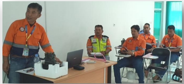
Training Center On Site